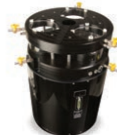
Mitral HiCycle Durability Tester (pg. 31)