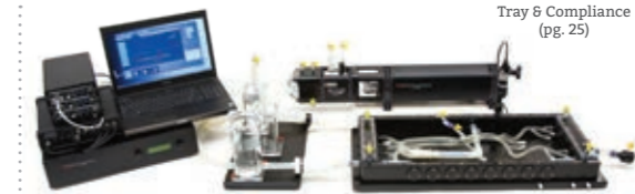
Endovascular Simulator Tray & Compliance (pg. 25)