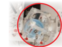
Large Atrium Chamber (Mitral) (pg. 16)