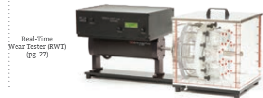
Real-Time Wear Tester (RWT) (pg. 27)