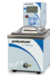
Heat Bath (pg. 20)