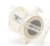
Heat Exchanger (pg. 20)