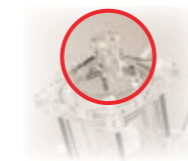
Transfemoral Catheter Access (pg. 21)