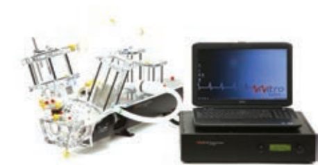
Pulse Duplicator (pg. 13)