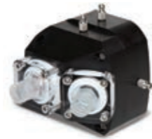
Pump Head (pg. 12)