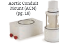
Aortic Conduit Mount (ACM) (pg. 18)