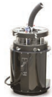
HiCycle Durability Tester (pg. 29)