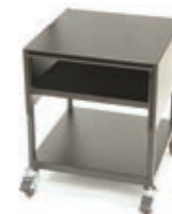
HiCycle Cart (pg. 33)