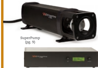
SuperPump (pg. 9)