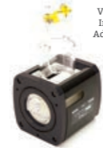
Viscoelastic Impedance Adapter (VIA) (pg. 12)