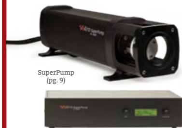
SuperPump (pg. 9)