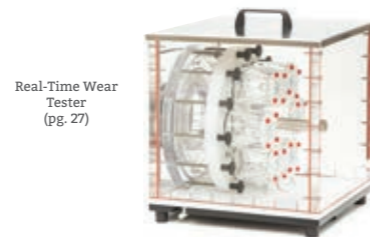
Real-Time Wear Tester (pg. 27)