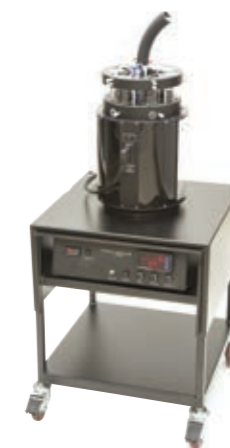
HiCycle Durability Tester (pg. 29)

No part of this publication may be reproduced, stored in a retrieval system or transmitted in any form or by any means, electronic, mechanical, photocopying, recording, scanning or otherwise without the prior written permission of the Publisher.