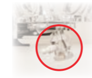
Transapical Catheter Access (pg. 21)