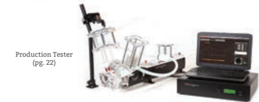
Production Tester (pg. 22)