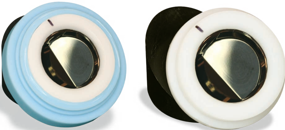
Figure 1: ViVidro Reference valve. Shown with silicone holder (left) and without (right).

Each reference valve comes with a certificate of conformance showing the operating conditions used to test the valve and the results obtained. These demonstrate the valve meets ISO 5840:2021 requirements. Test the reference valve in your Pulse Duplicator system to demonstrate that it gives the expected results and complies with ISO 5840:2021 requirements.